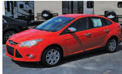
2012 FORD FOCUS SE Only 84 K, 4 cyl, 38 MPG. AS LOW AS $179/MO.