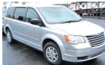
2008 CHRYSLER TOWN & COUNTRY Stow-N-Go seats, 4 captain chairs, seats 7, only 94 K. AS LOW AS $199/MO.