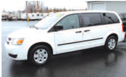
2008 DODGE GRAND CARAVAN SE. Stow-N-Go, seats 7. AS LOW AS $199/MO.