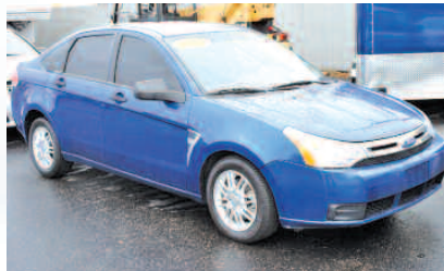
2008 FORD FOCUS SE 35 MPG. AS LOW AS $169/MO.