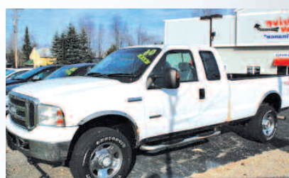
2006 FORD F-350 XLT SUPER DUTY V-8, Power stroke turbo diesel, 4x4, FX4 Off Road, seats 6, bedliner, tow pkg, 136 K. AS LOW AS $219/MO.