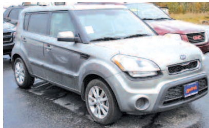
2012 KIA SOUL 6 speed, hands free phone, FWD, 30 MPG. Only 82 K. AS LOW AS $189/MO.

BAD CREDIT? NO PROBLEM! Guaranteed Credit Approval