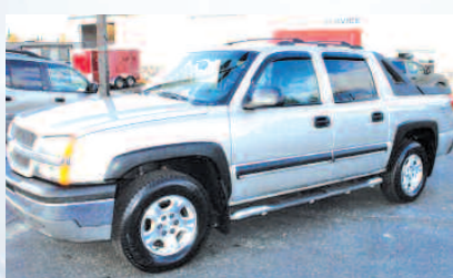
2004 CHEVY AVALANCHE 4x4, tow pkg, 4 door. AS LOW AS $279/MO.