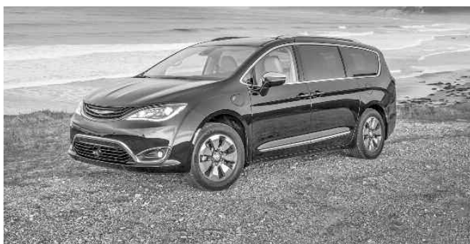
The all-new 2017 Chrysler Pacifica Hybrid electrifies the minivan segment, adding an innovative, advanced hybrid powertrain to the Pacifica's no-compromises combination of functionality, versatility, technology and bold styling.