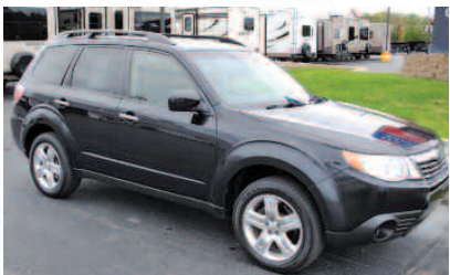
2010 SUBARU FORESTER AWD, extra large moonroof. Great car for winter. AS LOW AS $219/MO.