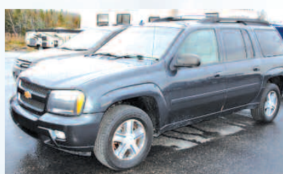
2006 CHEVY TRAILBLAZER LT 4WD, tow pkg, power moonroof, 3rd row seat. AS LOW AS $199/MO.