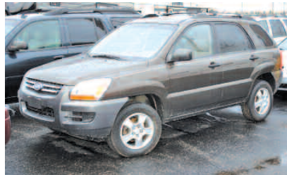
2007 KIA SPORTAGE LX 25 MPG. AS LOW AS $179/MO.