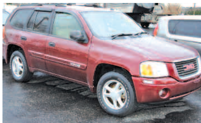
2005 GMC ENVOY 4x4, tow pkg. AS LOW AS $209/MO.