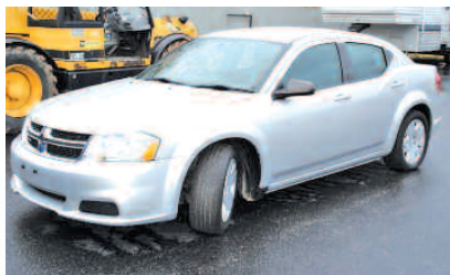
2011 DODGE AVENGER 29 MPG. AS LOW AS $199/MO.